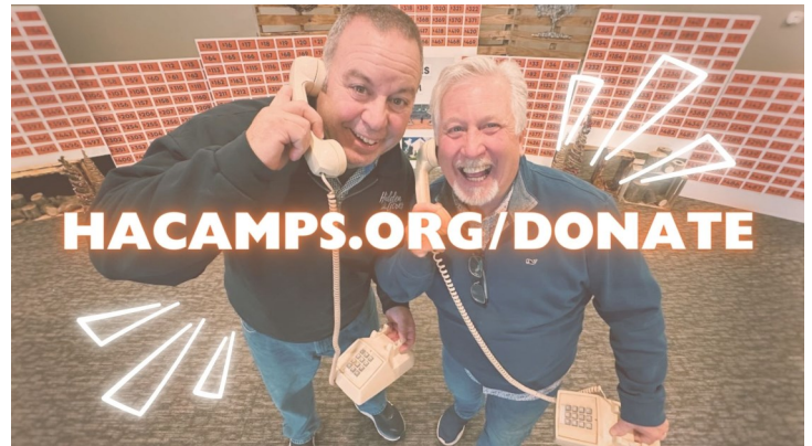
A fun promotional image used during the telethon!

presented these needs to our churches, donors, and camp friends, people have responded in such an encouraging way. Last month on Giving Tuesday we set out to raise $125,000 via a live telethon. It was a big goal, and our staff sent out letters to friends asking for their support. We went live on Facebook and YouTube at 9:00 am. The live stream included fun with emcees, chats with Hidden Acres staff, and summer camp highlight videos. Between the checks that arrived in response to our staff's letters, two matching gifts, and phone and online donations from that day, we exceeded our goal and raised over $178,000. Praise God!